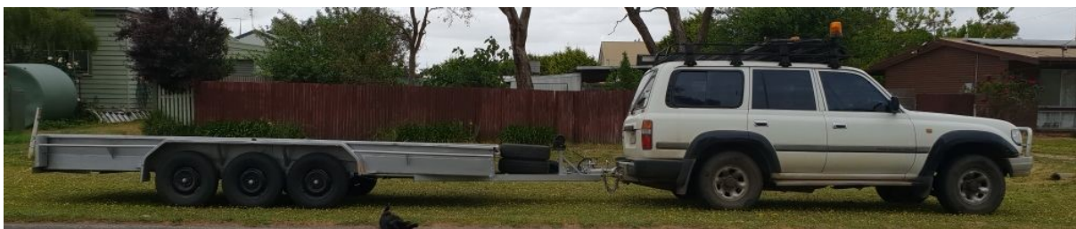
Figure 1 1991 Toyota Land Cruiser wagon with 1-ton tri-axle trailer