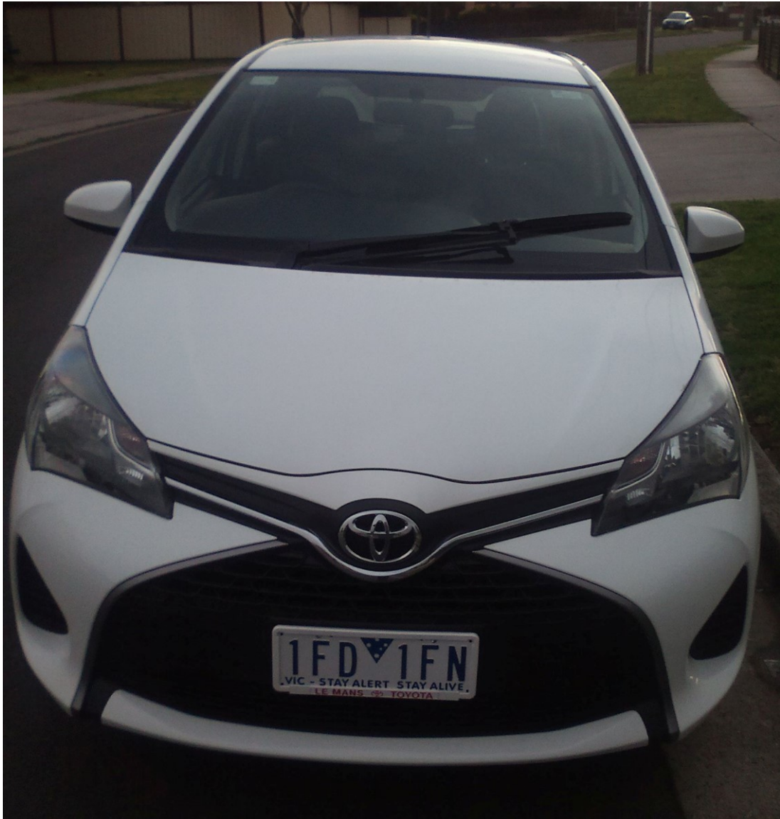
Figure 1 Yaris 2015 white 1.3 L 5 door hatch

N.B. Raised silicon (dirt) levels in the oil analysis correspond to driving on dirt roads in the country: The air filter was changed three times to ensure the problem was not a faulty filter. Dirt particles in the oil are one of the main causes of wear in an engine but after treatment with Xcelplus wear was reduced by an average of 82 %.