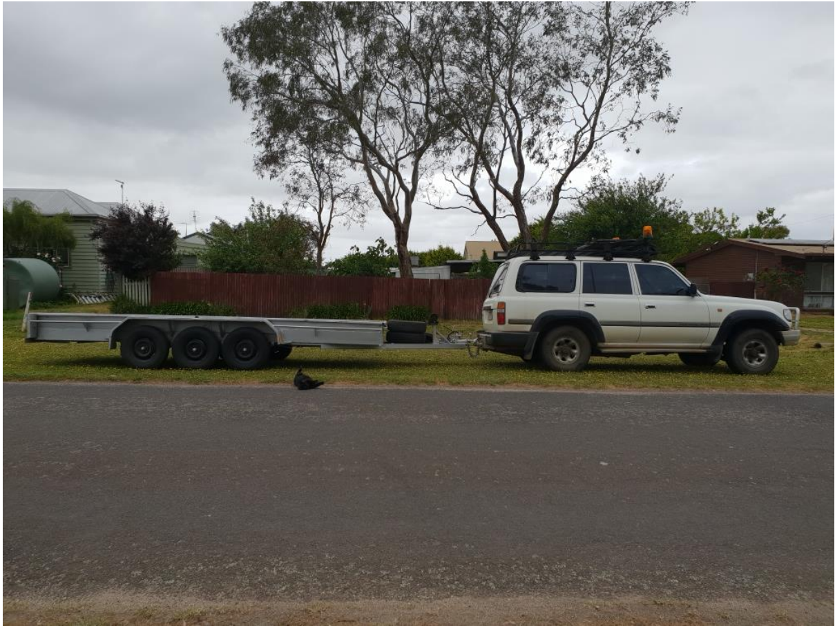
Figure 1 1991 Toyota Land Cruiser wagon with 1-ton tri-axle trailer